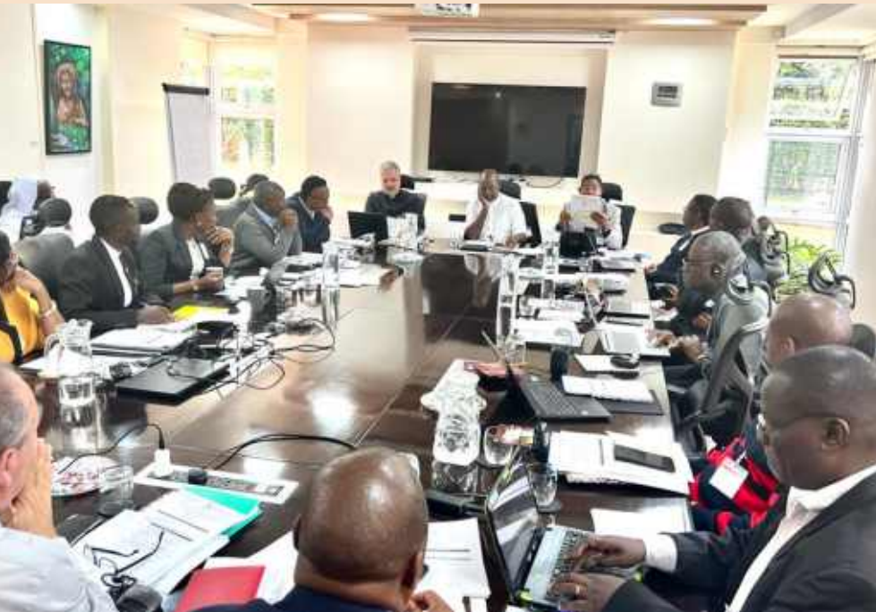
Gathering of experts from across the African continent prepare next March's Synodal Continental Assembly.

Africa (CERNA); Association of Member Episcopal Conferences of Eastern Africa (AMECEA) and Inter-Regional Meeting of the Bishops of Southern Africa (IMBISA) and Episcopal Conferences of the Indian Ocean (CEDOI).